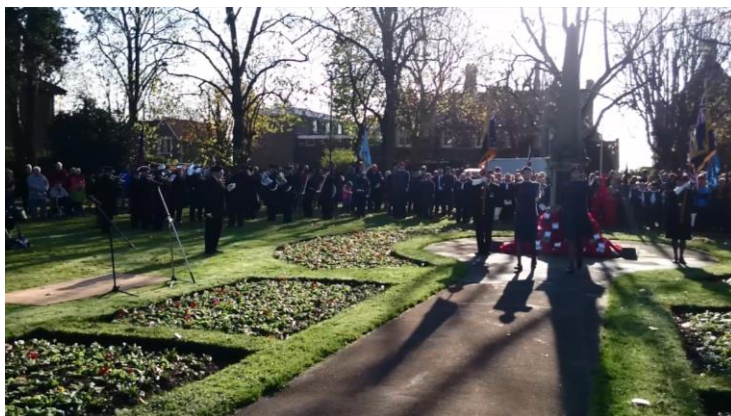
At the Cenotaph, Page Park, Staple Hill