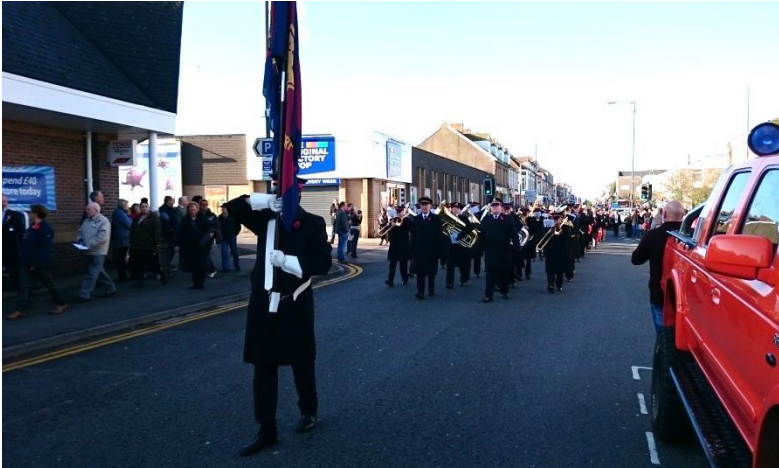
Staple Hill Citadel Band Leading the Parade on Remembrance Day 2014