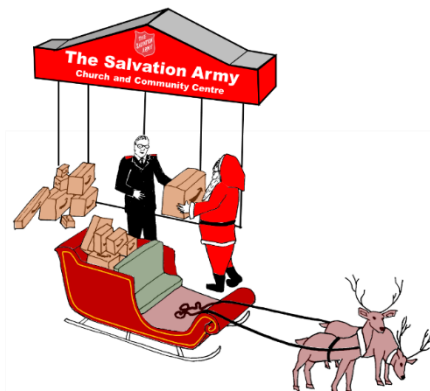
More donations arrive for the Christmas Toy Appeal